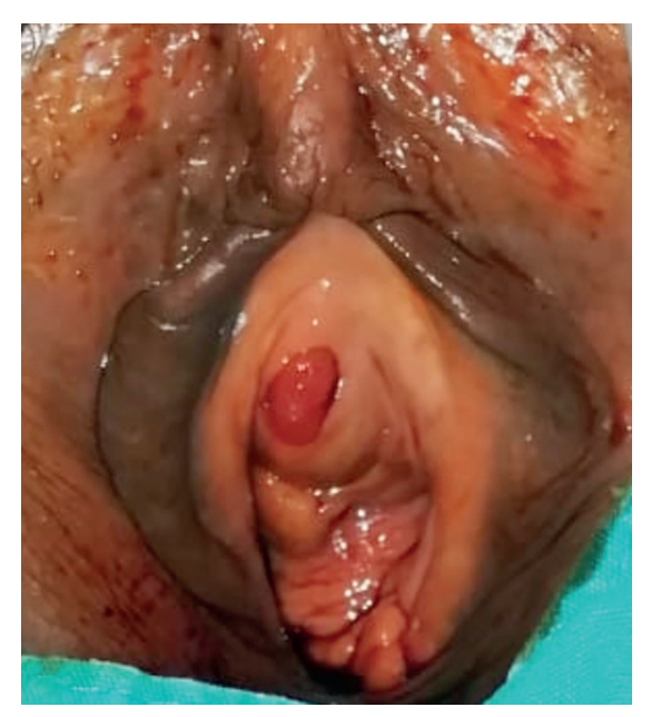
Figure 1. Red polypoid lesion extending out of the urethral meatus.