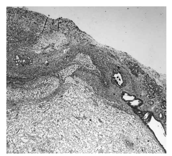
Figure 3. Minor salivary gland mucocele. (40 x hematoxylin/eosin).