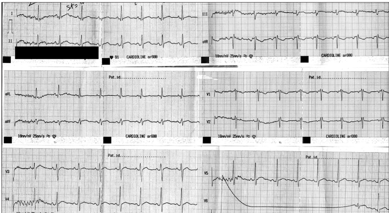
Figure 1. Electrocardiogram of the patient obtained at admission. ST-segment elevations were present in all leads except leads V1 and aVR, in which ST segment depressions were observed.

In the electrocardiographic (ECG) examination, ST-segment depressions of 1 mV in leads V1 and aVR, and ST segment elevations in all other leads were observed (Figure 1). Plain chest X-ray was unremarkable. Complete blood count revealed a white blood cell count of 15.000/mm 3 with a neutrophilic dominance. In biochemical analysis acute phase reactants were increased as: C reactive protein: 45.2 mg/dl and erythrocyte sedimentation rate: 56 mm/h. Other biochemical parameters including renal and liver function tests, and cardiac biomarkers including Troponin I and NT-proBNP were unremarkable.