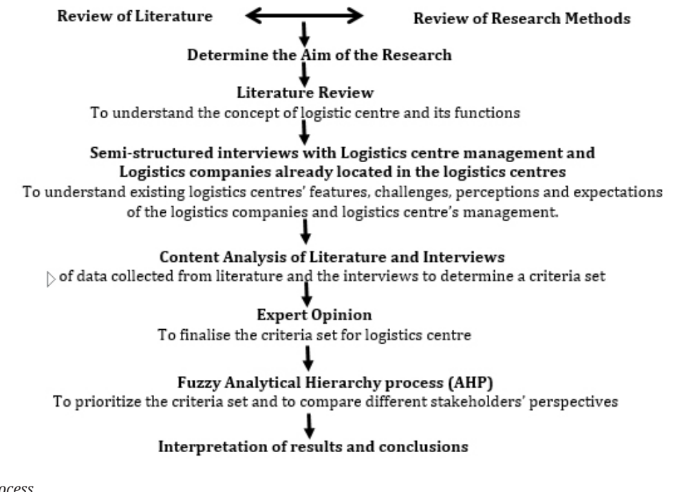
Figure 1. Research process AHP: Analytic hierarchy process

Interviews were conducted with both private sector and state logistics centers. Among the private sector logistic centers, we selected the first one to start operating because all the others were either too small, in the project phase, or under construction. Among the Turkish State Railways (TCDD) logistics centers, four were selected because they