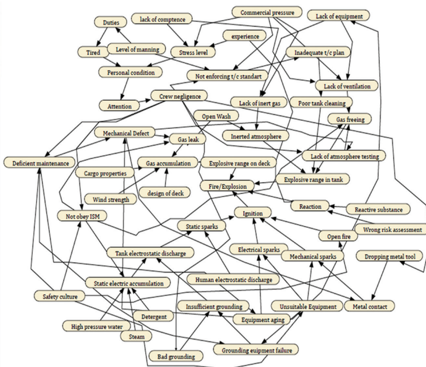
Figure 3. Fuzzy Bayesian Based Safety Assessment Model for Tank Cleaning Operation on Oil/Chemical Tanker