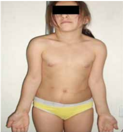
Figure 1. Physical findings of the patient suggestive of both neurofibromatosis 1 and Noonan syndrome

A 13-year-old girl presented with short stature. Physical examination showed dysmorphic facial features, a short and