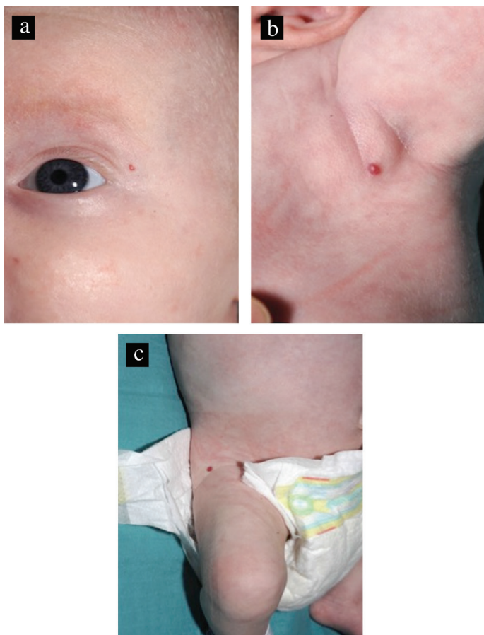
Figure 1. Cutaneous infantile hemangiomas a) at the left lateral canthus, b) left axilla, c) and right lateral thigh

Following discussion with colleagues in dermatology and cardiology, the patient was started on propranolol 1 mg/kg once daily, in two divided doses (6,12,13,14,15). This was escalated to 2 mg/kg after five days, with close monitoring of blood pressure, heart rate and capillary glucose levels. Treatment was well tolerated with no documented side effects, and within two days of commencing propranolol gamma-glutamyl transpeptidase had decreased from 522 to 426 U/L (normal range 6-42 U/L) and continued to do so in a linear fashion (Figure 3). This coincided with clinical improvement and a subsequent ultrasound at eighteen weeks of age confirmed improvement in the hepatomegaly, with a reduction in the size and number of lesions. This correlated with involution of the cutaneous hemangiomas. Post-treatment the child is well, with normal developmental milestones.