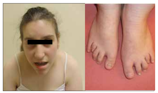
Figure 1. Facial and foot appearance of Case 1

OGTT: oral glucose tolerance test, TSH: thyroid stimulating hormone, fT4: free thyroxine, Anti-TPO: anti-thyroid peroxidase, Anti-TG: anti thyroglobulin, IgA: immunoglobulin A, IGF-1: insulin-like growth factor-1, IGFBP-3: IGF binding protein-3