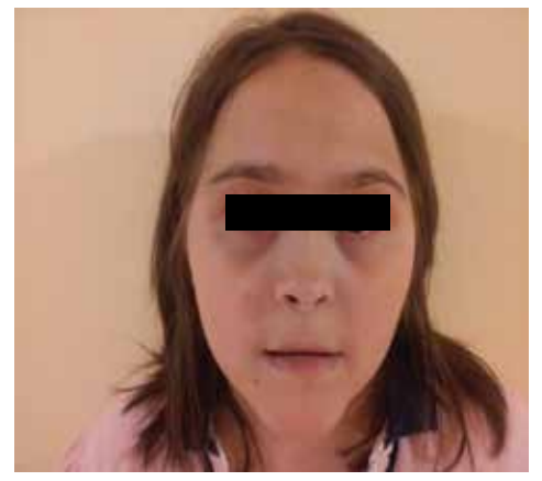
Figure 2. Facial appearance of Case 2