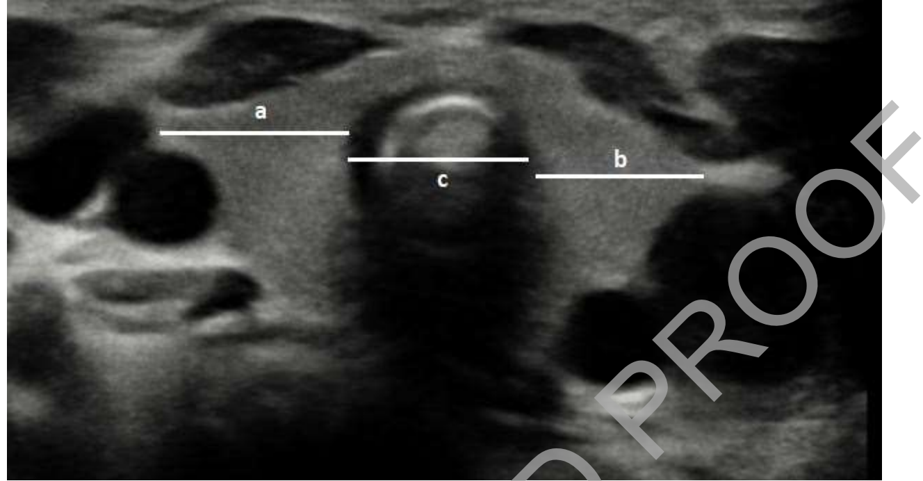
(The sum of the maximum width of each thyroid lobe (a+b) divided by the width of the trachea at the level of the thyroid (c) gives the transverse sonogram tracheal index)

Figure 1. Calculation of the tracheal index on a transverse sonogram of the thyroid.