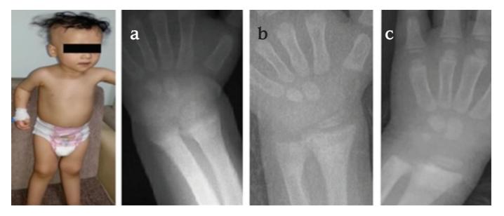
Figure 1. Alopecia and rickets in case 1

As shown in Table 1, the patient was initially treated with high doses of oral calcium (elemental Ca: 2 g/day), phosphate (1 g/day), and calcitriol [1\alpha-25(OH)D_3] (2 µg/day). Elemental calcium and calcitriol were subsequently increased to 4 g/day and 6 µg/day, respectively. After 8 weeks of this protocol, serum Ca concentration became close to normal levels, but PTH was not suppressed and ALP was still high, and no radiological improvement was observed. Treatment was continued with high-dose oral calcium and calcitriol. After 6 weeks, the patient was admitted to hospital again with hypocalcemic seizures. During this period, HVDRR was confirmed by VDR gene mutation and intravenous calcium infusion was initiated. Elemental calcium was administrated at 150 mg/kg/day, infused via central line over a period of 10 hours for five days in a month. She