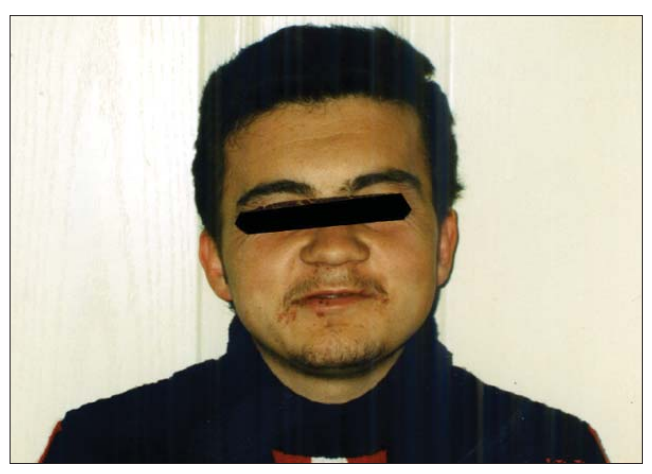
Figure 4. Facial appearance of the patient at 24 years of age

Linglart et al (11) investigated the role of the different mutations of GNAS in various clinical phenotypes observed (genotype-phenotype correlation). They could not find clinical or biological heterogeneity between the PHP-la patients with and without GNAS gene mutation. However, they demonstrated that the proband with a mutation resulting in a premature stop codon and truncated protein had a severe multihormonal resistance phenotype. The phenotype appeared to be milder in two cases and severe in one with substitutive mutations. A 41-year-old patient with R280K mutation, who had been followed for 29 years was shown to have isolated PTH resistance without TSH resistance, whereas the second mild case had AHO and TSH resistance but compensated PTH resistance. The patient who showed severe clinical symptoms was diagnosed in his first year of life, had TSH resistance and developed PTH resistance similar to our patient (11). Ahmed et al (5) reported PTH and TSH resistance in a 6-year-old girl who manifested with brachydactyly and subcutaneous calcification and had