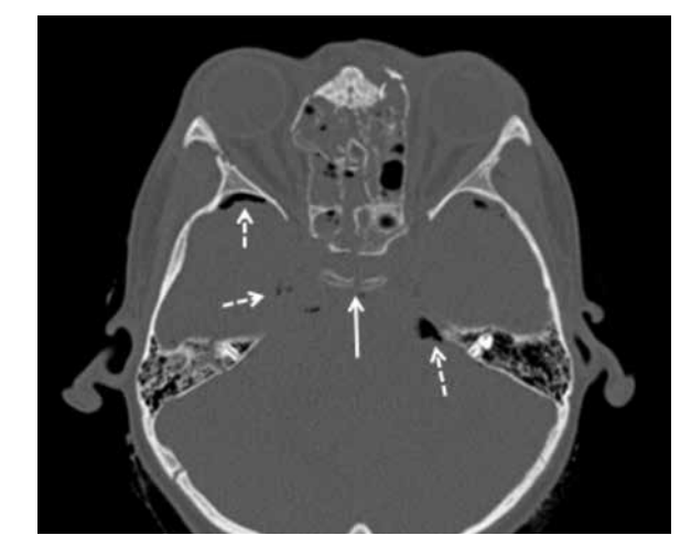
Figure 1. Axial unenhanced computed tomography image at the level of the orbits shows displaced fractures through the nasal bridge, ethmoid sinus walls, nondisplaced fracture through the right lateral orbital wall and depicts a fracture extension through the skull base and sella (arrow). Also, mix type fracture of the right temporal bone, loss of aeration of the right mastoid air cells and foci of pneumocephalus (dashed arrow) are observed

GH is an anabolic hormone that increases height in children (9). The hallmark symptoms of GH deficiency are