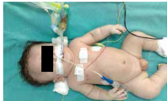
Figure 2. Short limbs particularly in the proximal portions, short fingers, skin folds on limbs, short neck