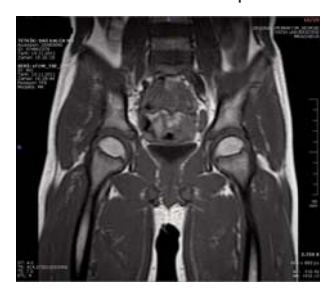
Figure 3: A coronal MRI section of the patient's pelvis shows no abnormality except minimal free fluid.