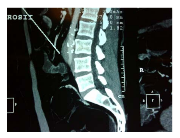
Figure 2: Sagital CT show retroperitoneal Para aortic mass.

polyuria, or anorexia, Patient also has denied any past history of abdominal injures, or any previous surgery, the patient Drug history is: amlodipine, statin, he denied any other medication as ergot, beta-blockers, methyl dopa etc.