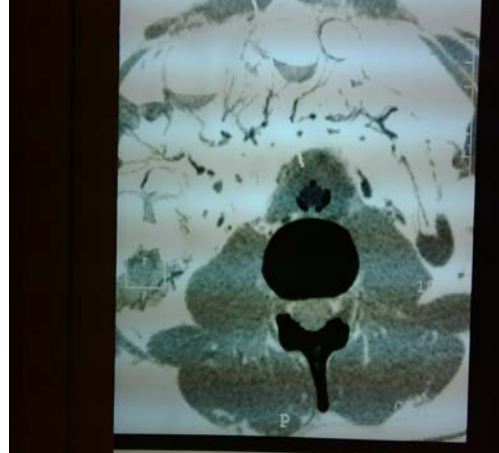
Figure 1: CT show retroperitoneal Para aortic mass at lower aortic root before bifurcation.