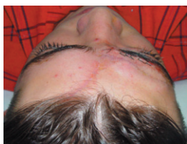
Figure 3b: Postoperative appearance of the third case after revision.

Eyebrows have a very important effect in the formation of a facial expression. They assist in the existence of various mimics. Other than these, the eyebrows prevent the sweat drops from falling directly on the eyes and work as umbrellas to reduce the effects of the ultraviolet rays before reaching the eyes. I feel the need to emphasize the importance of the bony orbital rim that the eyebrow hair sits on, which is essential for all these functions to be fulfilled. The supraorbital rim is formed entirely by the frontal bone, which is very strong. The rim is a well-butressed structure, which protects the underlying important structures and supports the eyebrow contour. Its defects can cause both functional and cosmetic problems (3).