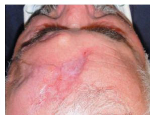
Figure 1c: Late results without eyebrow reconstruction.

graft and the debrided area, a midline flap was transferred. The donor site was closed primarily (Figures 2d, 2e). No further surgery was required. The complaint of light overexposure with depressed feature of the medial supraorbital rim disappeared (Figure 2f).