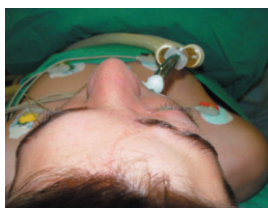
Figure 3a: Preoperative photograph of the third case from cephalocaudal direction. Note that the right globe is much more visible than the left.