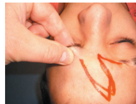
Figure 2d: On physical examination, the eyebrow on the healthy side can be pinched by fingers.