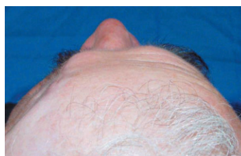
Figure 1a: Laterally located left supraorbital rim defect.

A 16-year-old boy presented with light overexposure. The patient history showed that he underwent a surgery for congenital cranial tumour which diagnosed 15 years ago. Following early days of the operation, his parents realized a small depressed area in their son's right supraorbital region, but they never sought any treatment for it. As the patient grew up, he started to complain from time to time about light overexposure to his right eyeball. On his physical examination, a small depressed area was visible on his right supraorbital region near the glabella (Figure 2a). The CT scan demonstrated a small bony defect (Figure 2b). A 1x1.5x2 cm 3 bone graft was taken from the iliac crest (Figure 2c). It was fixed to the defect area with 3-0 nonabsorbable suture material after opening three small holes on the bone graft. The bone graft was fixed to its new place by passing the sutures through the holes and the subcutaneous tissues around the bony defect. To cover the bone