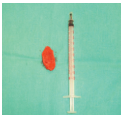
Figure 2c: Obtained iliac bone graft with a scale.