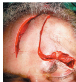
Figure 1b: Elevated midline forehead flap in its place and the transferred bone graft.