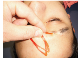
Figure 2e: The eyebrow on the injured side cannot be pinched. This shows that flap coverage will be required.