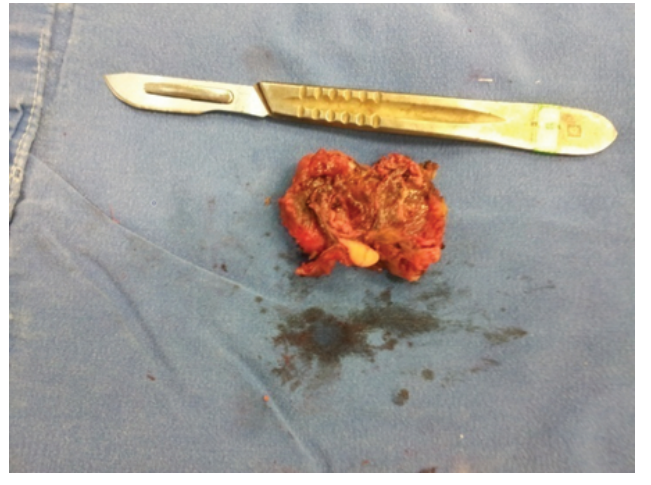
Figure 2 Macroscopic view of the pseudotumor after removal.