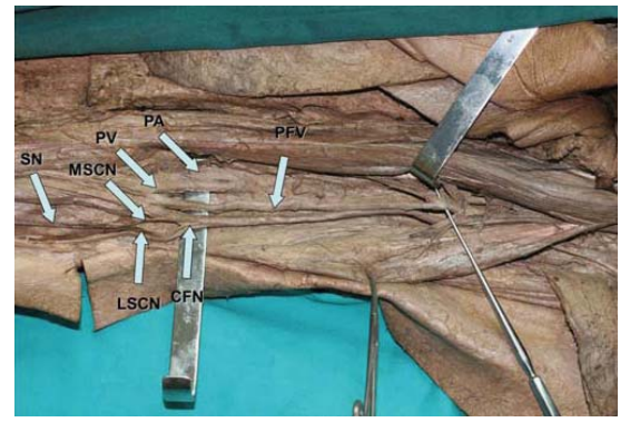
Figure 2: Dissection of right posterior femoral region. CFN: Common fibular nerve, LSCN: Lateral sural cutaneous nerve, MSCN: Medial sural cutaneous nerve, SN: Sural nerve, PA: Popliteal artery, PV: Popliteal vein, PFV: Profunda femoris vein.

side of a 65-year-old female formalin-fixed cadaver. This vein directly anastomosed with the popliteal vein distally (Figure 2). On examining its course in detail, we identified the profunda femoris vein, which proximally drained into the femoral vein 10 cm below the inguinal ligament. It lied deep to the long head of the bicep femoris and the semitendinosus muscles. Distally it was in the popliteal fossa and directly connected to the popliteal vein (Figures 2 and 3).