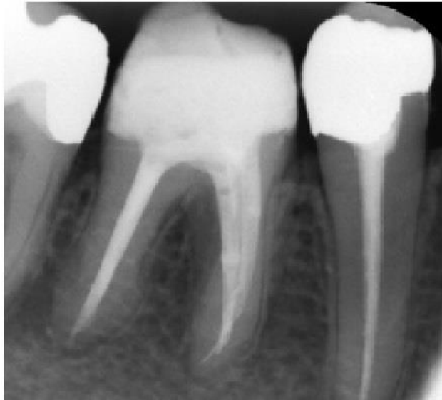
Figure 4. Follow-up radiograph taken 1 year after the completion of root canal treatment.

ProTaper rotary nickel-titanium instruments (Dentsply, Tulsa, Oklahoma, USA), a middle-mesial canal orifice was found between them. The presence of an additional root canal was confirmed with an operating microscope (Möller Denta 300, HS Möller-Wedel, Germany) under 24x magnification in conjunction with ultrasonics in the mesial root. In a periapical radiograph taken with three endodontic files in mesial root, it was showed that there are three independent root canals proceeding separately and joining at the apical third (Fig. 2).