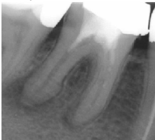
Figure 1. Pre-operative radiograph showing a mandibular first molar tooth with periradicular lesions requiring a proper root canal treatment.

In this case, non-surgical endodontic retreatment of a mandibular first molar tooth with three canals in mesial root was reported.