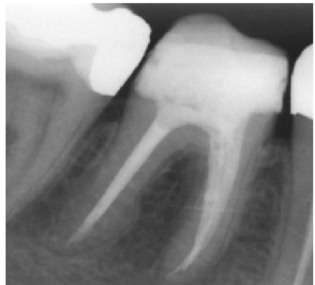
Figure 5. Follow-up radiograph taken 4-year after the treatment shows a complete periradicular healing of the lesions at both the mesial and distal root apices.

At the follow-up appointment 1 year later, the patient was symptom free and the radiolucencies at both the root apices were disappeared obviously (Fig. 4). When the patient was recalled for 4-year follow-up appointment, he was very satisfied with his tooth retreated. The periradicular lesions at both the mesial and distal root apices showed a complete healing (Fig. 5).