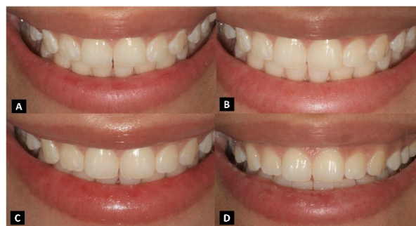
Figure 2: The white spot lesions occurred after tooth bleaching and intraoral condition during the remineralization treatment. A: Demineralized areas on fourth day after the bleaching. B: One week after the topical fluoride gel application. C: One week after the fluoride varnish application. D: One week after using the hydroxyapatite toothpaste.