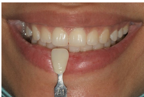
Figure 4: The view after two months.