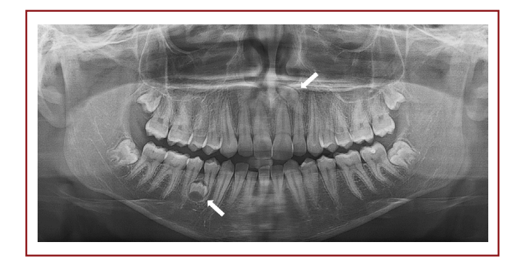
Figure 1. Arrows point to two supernumerary teeth, one located in the left intranasal region and the other embedded between premolars in the right mandible.

The orthopantomogram did not show any deficiency in the permanent dentition, but two supernumerary teeth were identified, one located in the left intranasal region