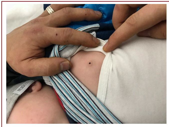
Figure 1. Bloody nipple discharge in a patient.

The eight patients comprised six (75%) girls and two (25%) boys. Median age at diagnosis was 15 years (minimum-maximum: 3–192 months). Their parents and older children suffered from daily bloody discharge that discolored the undershirt. BND was located in the left breast in five and in the left in three patients, and no bilateral BND was present in any patient (Fig. 1). On physical examination, applying pressure on the breasts resulted in the extraction of blood drops from the ipsilateral nipple in all cases. Two breasts had palpable cystic masses located in the areolar area, with no associated skin findings. One patient had only mild ten-