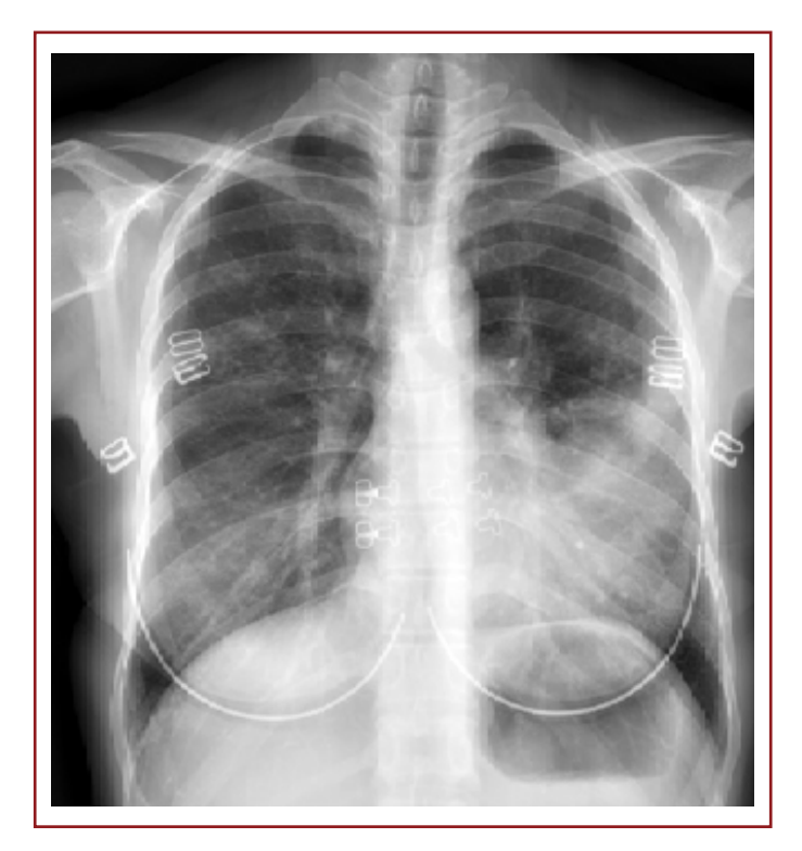
Figure 4. PA chest X-ray two and a half months after initiation of Tb treatment.

BAL cell profile was reported as follows: lymphocyte, 1%, PNL, 80%; eosinophil 3%; macrophage, 16%. Pathological examination of the materials obtained by bronchoscopy revealed septate fungal hyphae structures consistent with Aspergillus stained with Grocott stain in an area of the cell block of bronchoalveolar lavage. Aspergillus skin test was positive for an area of 7x10 mm. When clinical and laboratory findings were reviewed, in addition to a history of asthma, based on eosinophilia, total IgE elevation, presence of central bronchiectasis and positive skin test for aspergillus antigen, septate fungal hyphae structures compatible with aspergillus in lavage sample retrieved using a bronchoscope and the patient was diagnosed as ABPA. Then, oral-systemic steroid treatment was initiated with daily doses of 48 mg. Two weeks after the initiation of treatment, at the control visit steroid dose was gradually