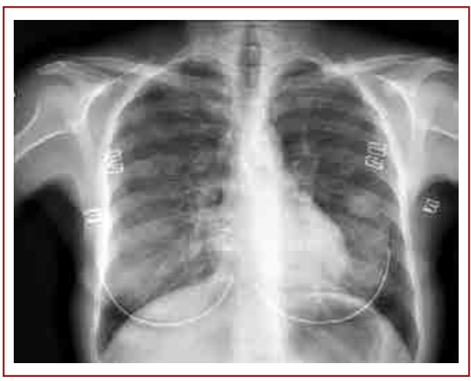
Figure 3. PA chest X-ray when the decision to start tuberculostatic treatment was made.