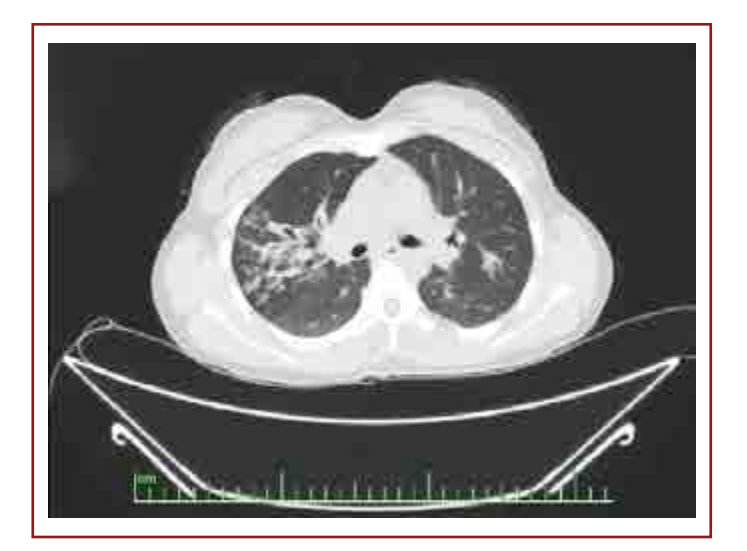
Figure 1. Thoracic tomogram at the first presentation of the patient.

After bilateral patchy infiltrations were detected on the posteroanterior (PA) chest X-ray, antibiotherapy was initiated with a preliminary diagnosis of pneumonia. Thoracic CT was performed because of the absence of any regression in the patient's complaints after 15 days, and the persistence of patchy infiltrations on the control chest X-ray. Thoracic CT scan revealed diffuse mosaic perfusion pattern in both lungs, thick asymmetric walled cavitary lesions the largest being 2 cm in diameter in the right lung upper lobe anterior and posterior segments, left lung upper lobe anterior and dense adjacent areas of alveolar-interstitial consolidation, budding tree patterns, and central bronchiectasis and diffuse bronchiolitis (Figs. 1, 2). The patient was thought to have pulmonary tuberculosis, and