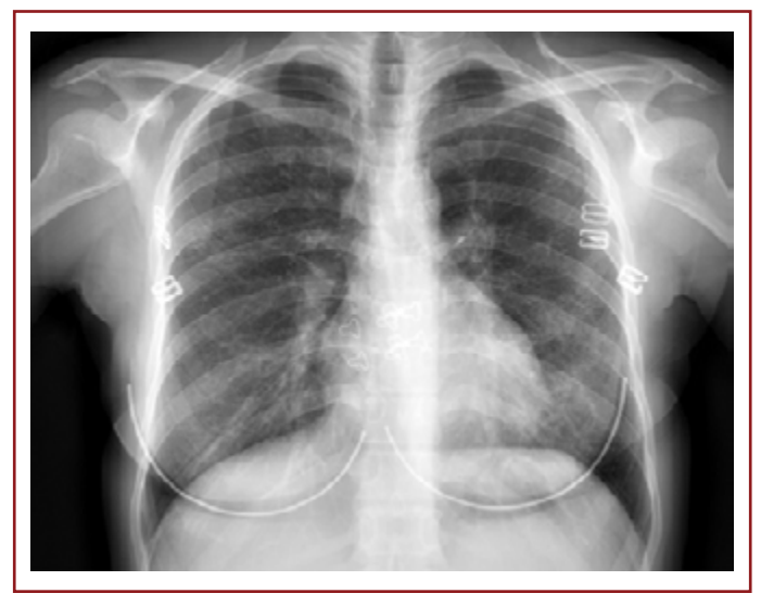
Figure 5. Control PA chest X-ray one month after initiation of steroid treatment upon diagnosis of ABPA was made.

After the diagnosis of ABPA, clinical staging will guide clinicians to plan treatment. ABPA was considered in five