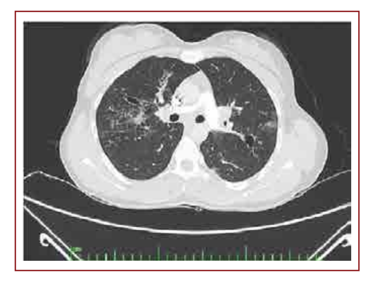
Figure 2. Thoracic tomogram at the first presentation of the patient -2.

The patient developed nausea and vomiting approximately one month after the initiation of tuberculosis treatment, and liver function test (LFT) results were found to be high; thus, anti-tuberculosis treatment was discontinued for one week. Tuberculosis treatment was resumed when LFT decreased to normal values. Approximately two and a half months after the treatment was started, the patient presented to us with nausea and vomiting again, and her