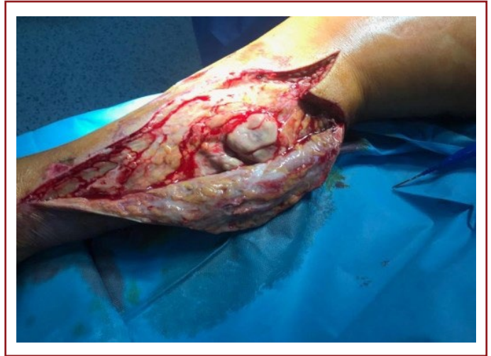
Figure 3. Infective image of the surgical area recorded intraoperatively.

hemoglobin: 10.7 (13–17), glucose: 170 (<100), CRP: 16.9 mg/L (0–0.8), ALT: 98 U/L (0–50 U/L), and AST: 100 U/L (0–50 U/L). As the present "bullous" lesions progressed rapidly in the following hours, the patient underwent emergency surgery with the diagnosis of necrotizing fasciitis (Fig. 3). Aggressive debridement was performed (Fig. 4). There were no aerobic and anaerobic growths in the cultures taken during surgery. When the patient's liver function tests were found to be elevated, the current antibiotherapy was changed to meropenem and teicoplanin. Since the necrotic areas of the right lower extremity continued to progress after the second operation, aggressive debridement was performed twice more at 3-day intervals. After deterioration of metabolic values and general condition of the patient, right hip disarticulation was performed 9 days after bullous lesions. Post-operative laboratory values were