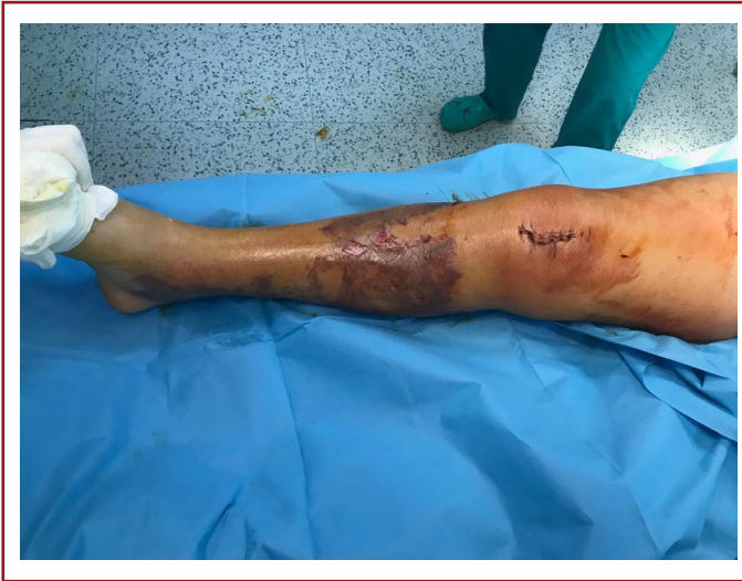
Figure 1. Bullous formations appearing in the midline of the crus on the postoperative 4th day.

areas as a result of microscopic examination of the joint puncture fluid. Gram staining showed Gram-positive diplococci. The patient who was compatible with septic arthritis as a result of puncture material was hospitalized and underwent emergency surgery. Intraoperative debridement and 6000 cc washing with 0.9% sodium chloride were performed. We consulted infectious disease department for starting antibiotherapy. Antibiotic treatment was started on the patient with ceftriaxone 1×2 g, teicoplanin 400 mg 12 h intervals, and three doses after 24 h intervals. In the culture taken during surgery, " S. pneumoniae " grew. "Bullous," crepitating lesions extending from the midline to the proximal right crus, occurred on the 4 th post-operative day while under antibiotic therapy (Fig. 1). X-rays and computer tomography (CT) angiography revealed diffuse "emphysematous" changes under the skin (Fig. 2a and b). Laboratory tests revealed leukocyte: 23800 (4000–10000),