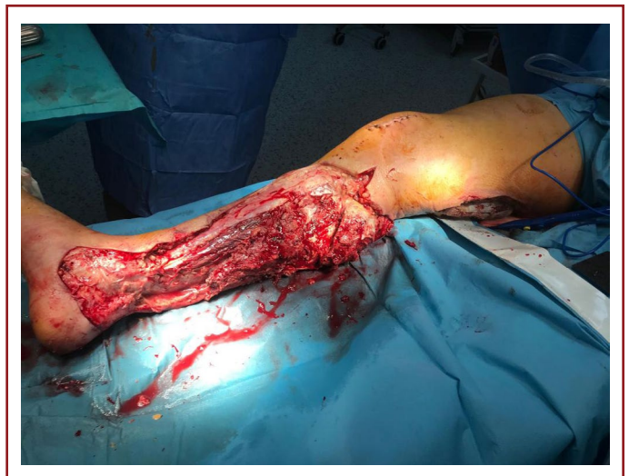
Figure 4. Image of the surgical area after aggressive debridement.

hemoglobin: 10.7 (13–17), glucose: 170 (<100), CRP: 16.9 mg/L (0–0.8), ALT: 98 U/L (0–50 U/L), and AST: 100 U/L (0–50 U/L). As the present "bullous" lesions progressed rapidly in the following hours, the patient underwent emergency surgery with the diagnosis of necrotizing fasciitis (Fig. 3). Aggressive debridement was performed (Fig. 4). There were no aerobic and anaerobic growths in the cultures taken during surgery. When the patient's liver function tests were found to be elevated, the current antibiotherapy was changed to meropenem and teicoplanin. Since the necrotic areas of the right lower extremity continued to progress after the second operation, aggressive debridement was performed twice more at 3-day intervals. After deterioration of metabolic values and general condition of the patient, right hip disarticulation was performed 9 days after bullous lesions. Post-operative laboratory values were