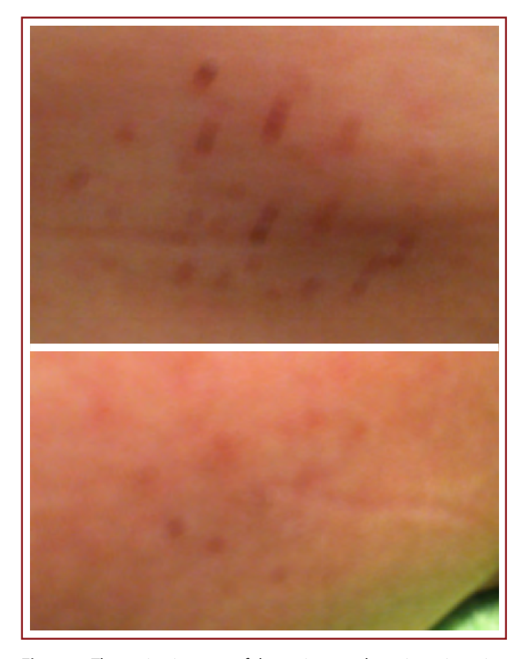
Figure 1. The projection area of the patient on the epigastric region and back where hijama has been applied.

In the physical examination of a 55-day-old male infant who applied to the Pediatrics Outpatient Clinic with the complaint of jaundice, it was observed that his whole body turned yellow. The patient's epigastric region and projection on the back (a circular area with a diameter of about three centimeters) had superficial, 3-4 millimeter mini-incisions made with a sharp instrument (Fig. 1). Detailed anamnesis revealed that the patient had a hijama treatment in a private center due to jaundice. The patient, who was found to have indirect hyperbilirubinemia (total