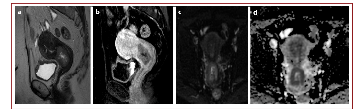
Figure 1. (a) T2 weighted, (b) contrast-enhanced T1 weighted, (c) diffusion weighted, (d) ADC mapping images in a 50-year-old patient with a pathological diagnosis of SCC. Mass lesion of the cervix, approximately 5×3 cm in size, with irregular contours, no prominent parametrial extension or adjacent organ invasion, accompanied by diffusion restriction, and low ADC values.

*=p<0.05, <sup>a</sup>(t)=Independent sample t-Test,b(r)=Pearson correlation test, SD: Standard deviation.