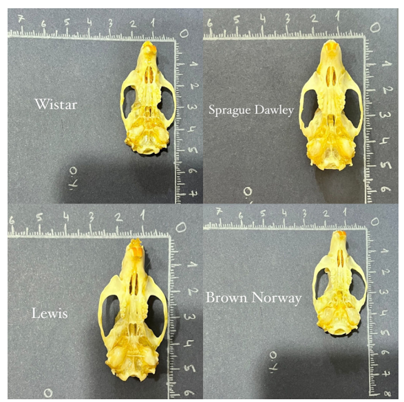
Figure 2. Ventral view of skulls