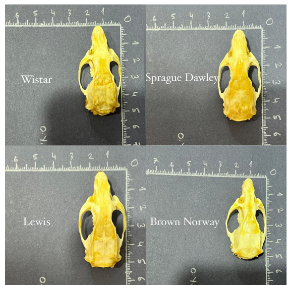
Figure 1. Dorsal view of skulls

Then, according to the metric determined by Driesch,<sup>21</sup> measurements were taken from 27 different skull zones using calipers (Figure 3 and Figure 4). Indexes were calculated using the method defined by Onar et al..<sup>13</sup>