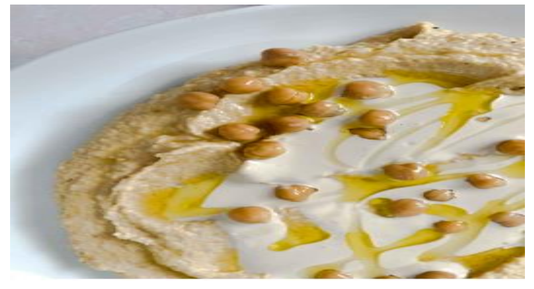
Figure 8. Tahini

It is known colloquially as "donkey tray, squeeze sour or donkey f.ck / eşek s...in". It is a very nice drink appetizer. It is also known by a different name in Antalya region in Turkey. It is made with tahini, garlic, salt, lemon (sour). By adding rusk to the tahini salad, it smells of tahini and is called rusk with tahini. It is also made by mixing boiled and crumbled fish into tahini salad (Figure 8).