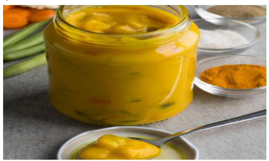
Figure 7. Bikla

Curry, mustard, vinegar, flour and salt are added to various vegetables while they are chopped and cooked as cubes. After preparation, it is stored in glass jars. It is the most popular appetizer of the drink tables. Especially in the Cypriot sandwich culture, it is widely used in sandwiches and eaten. It is thought that a sandwich without a biscuit would not have much taste (Figure 7).