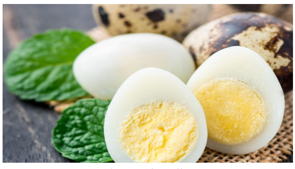
Figure 3. Quail egg pickles