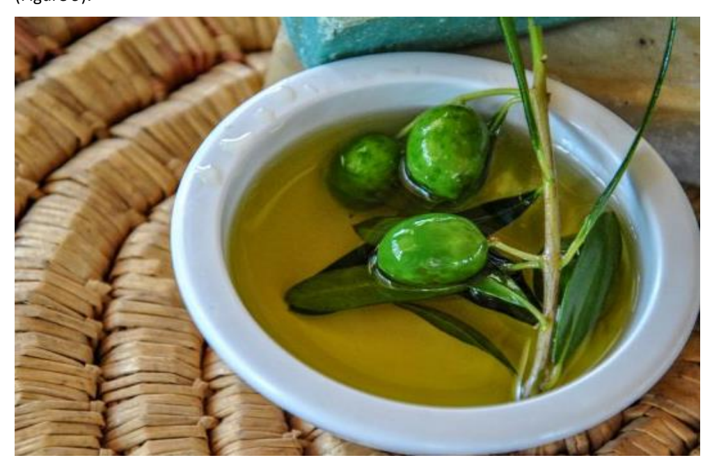
Figure 9. Cakıstes Gappar In Cyprus 'Capari', The miracle plant, which is known as the only pickled plant, is (Capari) among the alternative agricultural products. Pickles Boiled It is served with black-eyed peas, olive oil and pieces of garlic. Depending on the börülce season, boiled chard is added. (Black-eyed) Tahini Lemon It is an indispensable appetizer consisting of a mixture of tahini and plenty of lemon. Cyprus pasta, which Cypriots call 'Magarina Bulli', is served with Cypriot halloumi Magarina Bulli (with mint) and fried chicken (Figure 10).