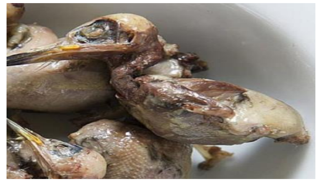
Figure 4. Amberibulya (Pulya)

The internal organs of the bird are not removed and injured birds should not be used. Otherwise, the pickle will spoil. After the birds are cleaned, they are boiled very little and left for a while to dry. After that, it is thrown into the circus. Since these birds are eaten with their internal organs, those who fight or joke in Cyprus often use the phrase "I will eat you as you are, like amberibulya" (Figure 4). J. Lorke, who visited Cyprus in 1533, writes that Amberibulya pickles were made in Limassol and exported to Venice (https://kibrissozluk.com/seniambelebulya-kusu).