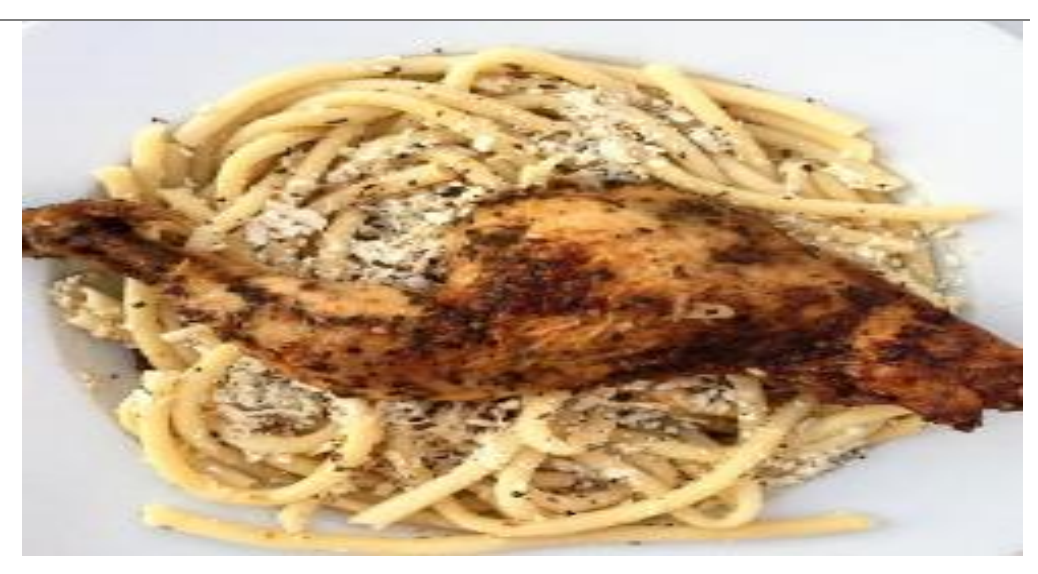
Figure 10. Magarina bulli