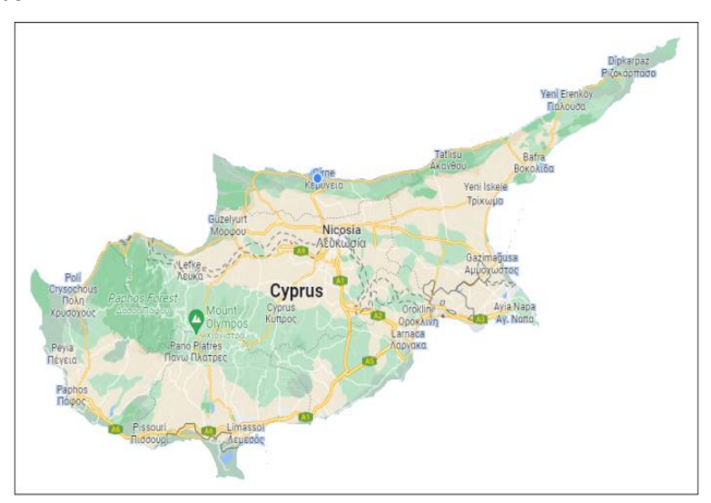
Figure 1. Map of Cyprus (https://www.google.com/maps)

In this study, the importance of gastronomy and the concept of gastronomy tourism, Appetizer Culture and History in the World and the Mediterranean Region, Turkish Cypriot Cuisine and Cypriot appetizers are mentioned. Information about Cypriot appetizers was collected from the taverns in Famagusta, Kyrenia and Nicosia which are the biggest districts of Northern Cyprus.