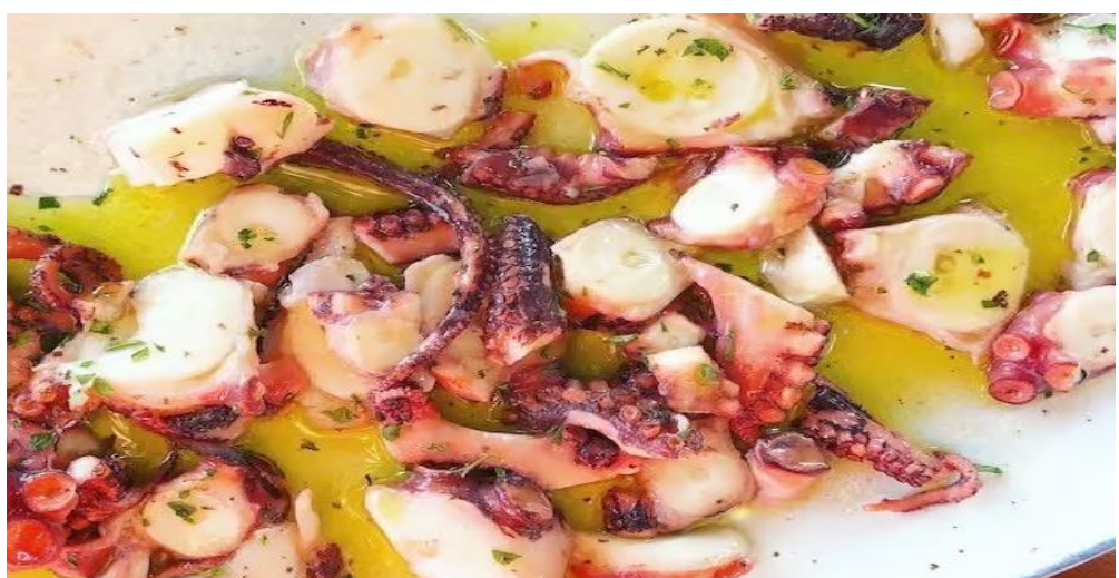
Figure 6. Octopus pickles

The ink, mouth and internal organs of the captured octopuses are removed. The octopus is bleached by hitting a stone or rock at least forty times and rubbing it on the stone-rock. It is seen that the foams that come out after this process no longer come out and the soft meat becomes hard. Afterwards, it is boiled in water, drained and dried, and the cubes are cut and placed in a jar. Garlic is put in it. Vinegar is poured on it as much as it takes, and olive oil is poured on it so that it does not get air. This layer of the pickle, which forms a layer over time, is called the mother of the pickle (Figure 6).