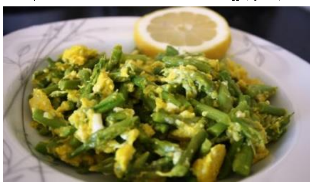
Figure 11. Ayrelli

Wild asparagus. It is harder, thicker and more characteristic than the foxglove grown in Turkey. It can also be consumed with olive oil or fried with eggs (Figure 11).