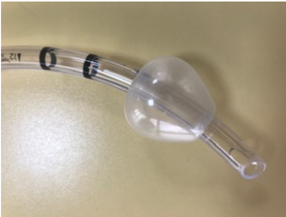
Figure 3. Conical cuff image of SSD-ET.