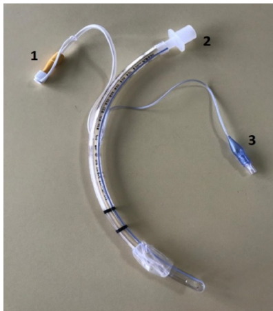
Figure 1. SSD-ET 1:Subglottic aspiration lumen, 2: Main tube lumen, 3: Tube cuff lumen