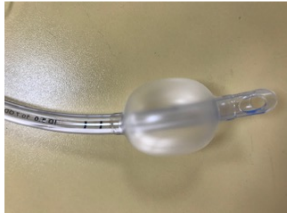
Figure 4. S- ET cuff image with cylindrical shape.

baseline), anesthesia was deepened and 2 \mu\text{g}/\text{kg} fentanyl was applied. For bradycardia, defined as (an HR < 50 beats/minute), the patients were administered 0.5 mg of iv atropine. Post-operatively all patients, still intubated, were transferred to the cardiovascular ICU. The same postoperative mechanical ventilation strategy was maintained as in the intra-operative period.