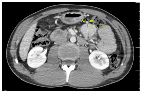
Figure 1. Abdominal Computed Tomography examination is showing, a homogeneous and markedly enhancing mass measured in 35 * 32 mm within the mesenteric fatty tissue in the upper left quadrant.

Abdominal ultrasound (US) revealed a solid hypoechoic mass lesion of 4 cm in size in the left upper quadrant. For further investigation, contrastenhanced abdomen CT was performed. A wellcircumscribed, round, soft tissue mass with dimensions of 35 \times 32 \times 41 mm (transverse x anteroposterior x craniocaudal diameters) adjacent to the mesenteric vascular structures, and demonstrating significant homogeneous contrast enhancement (mean HU=146.3) in the portal venous phase after intravenous injection of non ionic iodinated contrast agent (2 cc/kg), was detected in the upper left quadrant of the abdomen (Figure 1). There were also heterogeneous densities in the mesenteric adipose tissue around the mass.