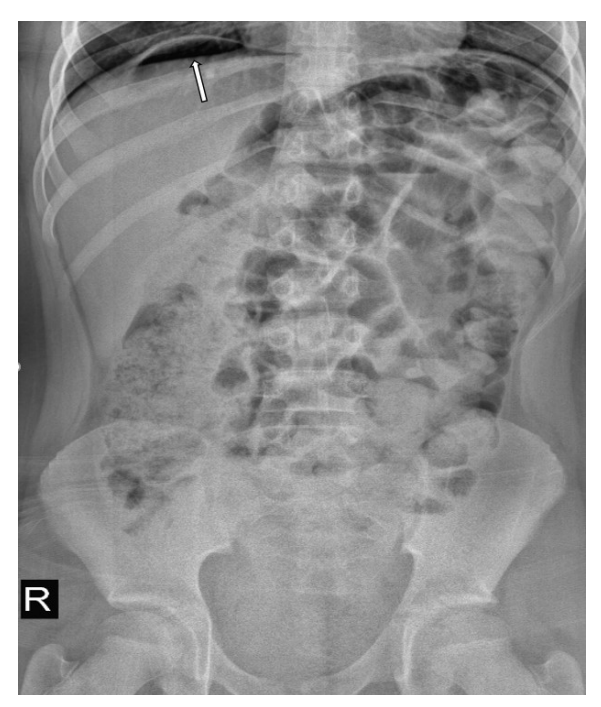
Figure 1. Free air below the right diaphragm on X-ray (arrow).

On physical examination, the patient was afebrile with normal vital signs. Chest breath sounds were equal bilaterally. The patient had no subcutaneous emphysema, abdominal distention and defense or rebound tenderness on abdominal examination. The painless solid mass was palpated in the pelvic area. Laboratory values showed normal leukocyte count (9500/mm<sup>3</sup>), hemoglobin value (12.4 g/dl) and platelet count (329000/mm<sup>3</sup>). Coagulation parameters and other biochemical parameters were within normal limits. No pneumothorax or pneumomediastinum was detected on the chest radiography. Erect