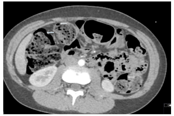
Figure 3. Abdominal CT revealed PCI in colon (arrow)

position. A nasogastric tube was placed perioperatively. Upon entering the peritoneum, a small egress of gas was noted. There was no free fluid in the abdominal cavity. When the distal esophagus, stomach and duodenum were evaluated, there was no evidence of perforation. Both leaflets of the diaphragm were intact. The air was injected into the nasogastric tube to evaluate stomach and there was no evidence of air leakage. The ascending, transverse and descending colon were mobilized and examined, any evidence of perforation was not detected. The huge fecalomas were detected in the whole colon. Laparotomy was terminated and position of patient was converted from supine to lithotomy position. Total colonic irrigation was applied and fecalomas were evacuated. Preoperative abdominal CT was re-evaluated by pediatric radiology department. PCI was detected in the ascending, transverse and descending colon (Figure 3). Oral intake started on the postoperative 2^{nd} day and the patient was discharged on the postoperative 4<sup>th</sup> day with maintenance of treatment for constipation.