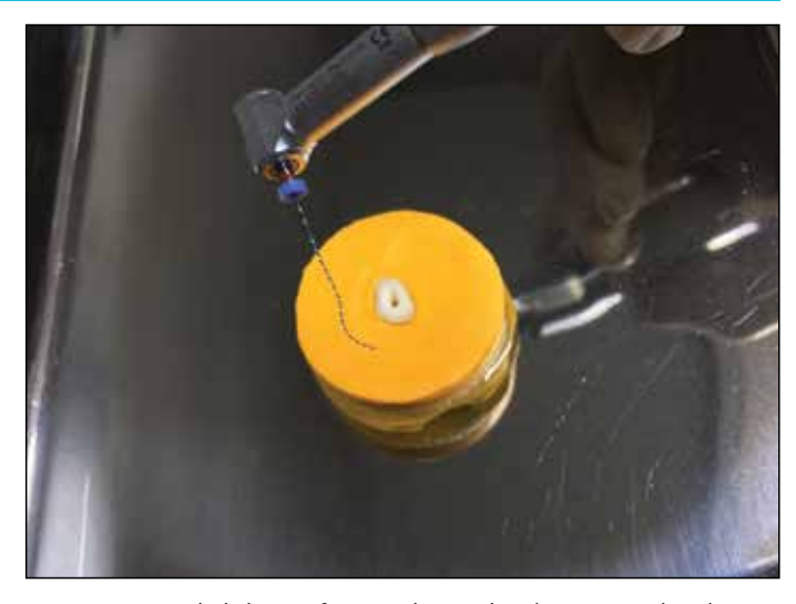
Figure 1. Expanded shape of XP-endo Finisher (austenitic phase)

A #10 K-file (Dentsply Maillefer) was inserted into the root canals and moved until the tip of the file could be seen from the apical foramen. The working length (WL) was established by subtracting 1 mm from this measurement. Subsequently,