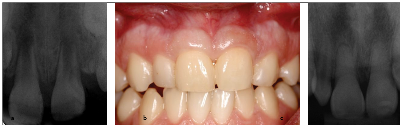
Figure 1. a-c. (a) Initial radiographic exam after dental replantation, (b) clinical aspect of maxillary central incisors at five years post-trauma, (c) radiography evaluation at 60 months

The surgical procedure was performed under local anaesthesia using mepivacaine 3% with epinephrine 1:100,000. An intrasulcular trapezoidal incision was performed to provide an adequate surgical field and access to the apical area. The flap was reflected and spherical burs #5 (Microdent, São Paulo,