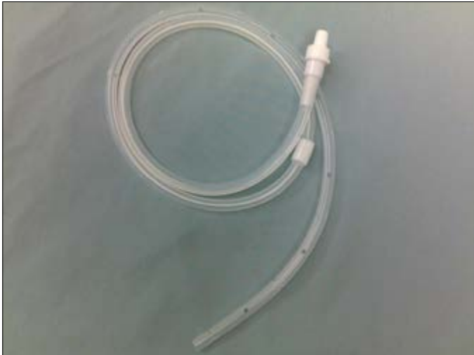
Figure 2. PleurX catheter