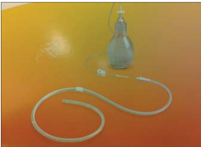
Figure 3. PleurX catheter and vacuumed bottle

lung fills the rib cage, with the help of an atomizer, 4-5 g of talc was applied into the rib cage via insufflation by covering all the visceral pleura (Figure 1a, b). After talc application, one chest tube is placed, and the operation is concluded.