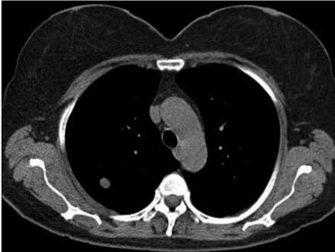
Figure 3. Computed tomography of the thorax (mediastinal window) showing a solid lobulated nodule

other foci. According to these findings, diagnostic intervention, CT-guided transthoracic fine-needle aspiration biopsy (FNAB) was performed. The cytological evaluation of the biopsy material showed inflammatory cells. As the FNAB results of the patient with a high probability of malignancy were not diagnostic, the nodule was removed by wedge resec-