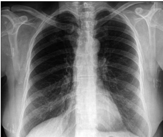
Figure 1. The postero-anterior chest X-ray of the patient showing a round nodule with indistinct margins, at the right upper zone

No abnormality was detected in the video bronchoscopic investigation of the patient and bronchoalveolar lavage fluid obtained from the right upper lobe revealed no malignant cells. In the positron emission tomography (PET), the SUVmax of the 15 mm nodule was reported to be 5.5, and there were no hypermetabolic lymph nodes or any