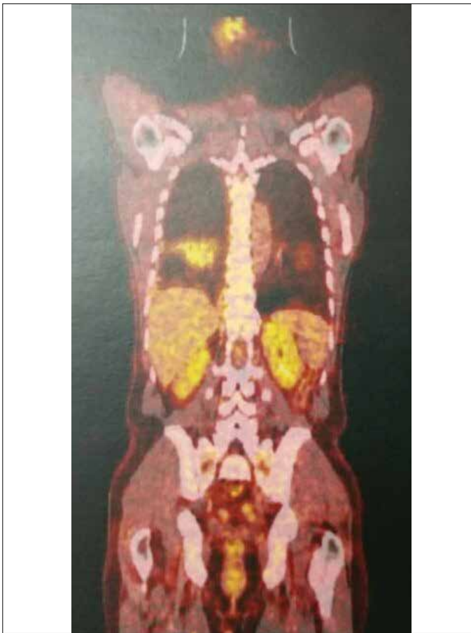
Figure 2. PET-CT Image PET-CT: positron emission tomography-computed tomography