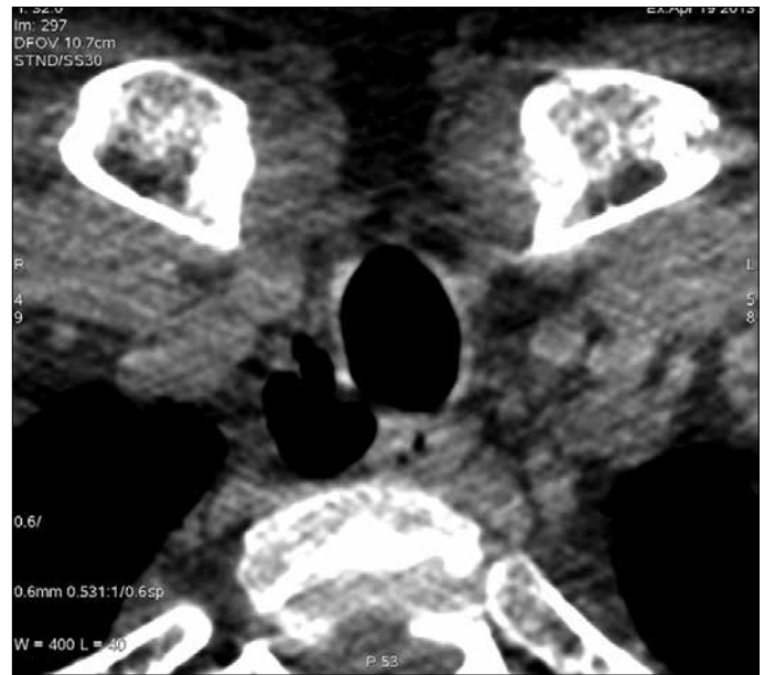
Figure 3. On CT axial section, right paratracheal diverticulum and its neck from oblique aspect

of the acquired form consists of only respiratory epithelium. Many acquired tracheal diverticula can exist with tracheobronchomegaly (5).