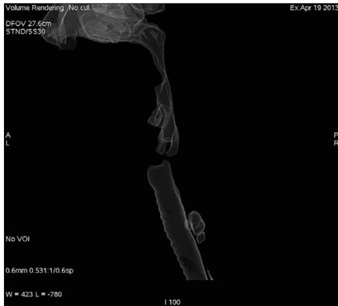
Figure 2. On 3D VR CT imaging, right paratracheal diverticulum from the left lateral aspect