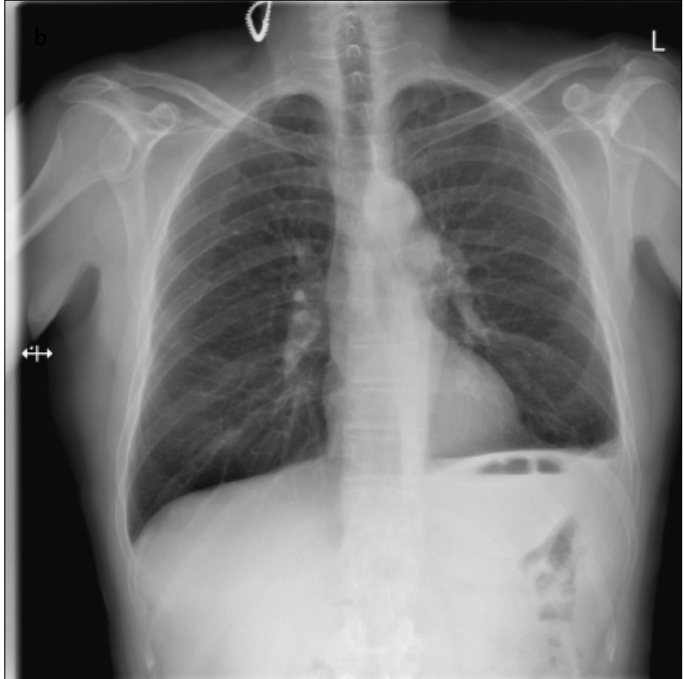
Figure 1. a, b. Chest radiograph showing blunting of the right costophrenic angle and left-sided pleural thickening during initial presentation (a), chest radiograph on clinical follow-up showing resolution of the chylothorax effusion post rituximab treatment (b)

ral biopsies both confirmed a low-grade B-cell non-Hodgkin's lymphoma with kappa light chain restriction and no expression of CD5, CD10, or cyclin D1. Lymphoscintigraphy identified chyle leak at the level of the T6/7 vertebrae (Figure 2). Positron-emission tomography scan found no focal tracer uptake.