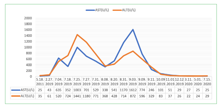
Figure 2. Liver enzyme levels.

of these patients develop HBV reactivation after R-CHOP or rituximab containing regiemens.<sup>[6]</sup> Three mechanisms have been speculated to explain the etiology of the higher risk of HBV-R in patients with lymphoma than other solid tumors.<sup>[7]</sup> First: lymphoma is a malignancy that originates from immune cells and lymphoma patients may have an intrinsic immune defect.<sup>[8]</sup> Second: the treatment regimen for lymphoma contains steroids that can suppress T cell function and even directly stimulate HBV replication. Third: a higher rate of HBsAg positivity has been reported in lymphoma patients than in other cancer patients and HBV is speculated to be involved in B-cell lymphomagenesis.<sup>[7,9]</sup>