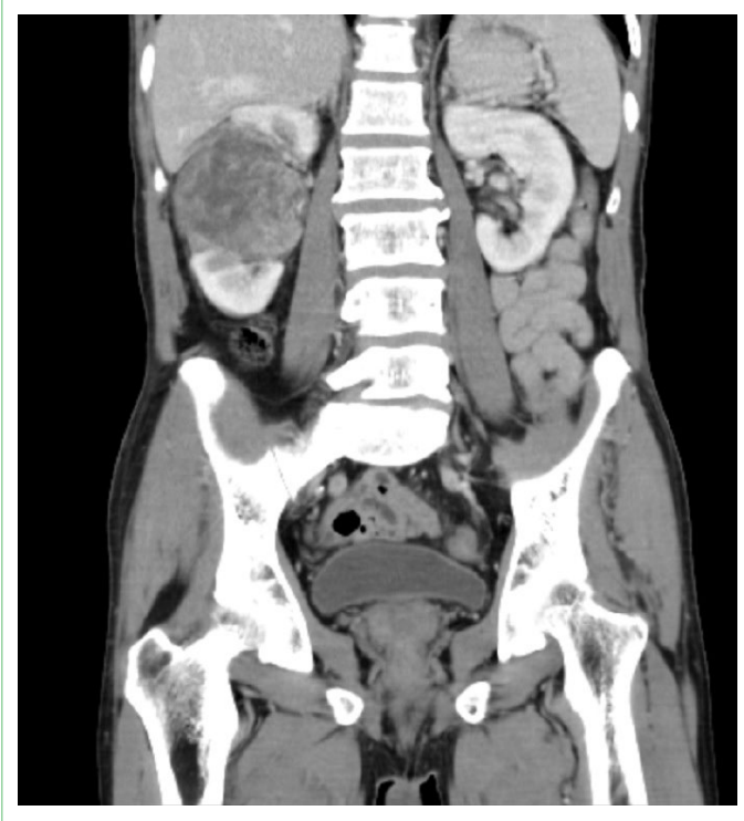
Figure 1. Coronal plane demonstrating the right upper pole renal mass.