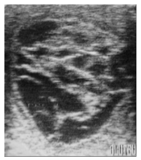
Fig. 1. Ultrasound of left gluteal region showing thick walled, well defined, cystic lesion with septa in the subcutaneous region overlying gluteus maximus muscle.

cystic lesion 5.1x3.4x2.6 cm in size in the subcutaneous tissue overlying the gluteus muscle.