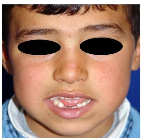
Fig. 1. Preoperative anterior view of the patient showing open bite deformity.

since this procedure was unsuccessful, the patient referred to the Gaziantep University Plastic Surgery Clinic. The clinical and radiological examination of head and neck region showed that there was no fracture or other pathologies at the joint, mandibula and zygoma (Fig. 1).