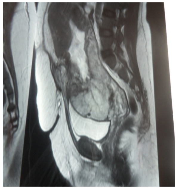
Fig. 2. MRI of the uterus containing placenta on the tenth postpartum day.

10.9 gr/dL and during the operation 2 units of fresh complete blood were transfused. Hemoglobin was 8.4 gr/dL on the first day, and fell to 5.7 gr/dL on the fifth day, postoperatively. Two units of erythrocyte suspension were given. On the third day, serum beta-hCG was 6021 IU and decreased to 2182 IU on the ninth day. Beginning from the seventh day, 50 mg/m² methotrexate (MTX) iv was applied weekly for three times. During MTX treatment breastfeeding was avoided. Pelvic MRI was repeated on the tenth day (Figure 2) and the patient was