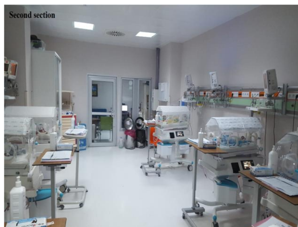
Picture 2. NICU second section