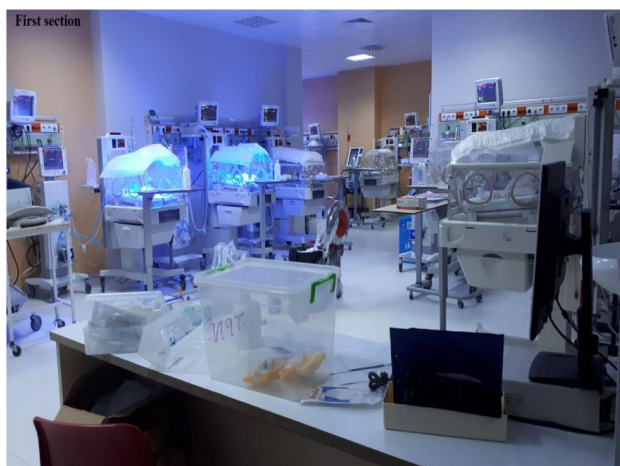
Picture 1. NICU first section