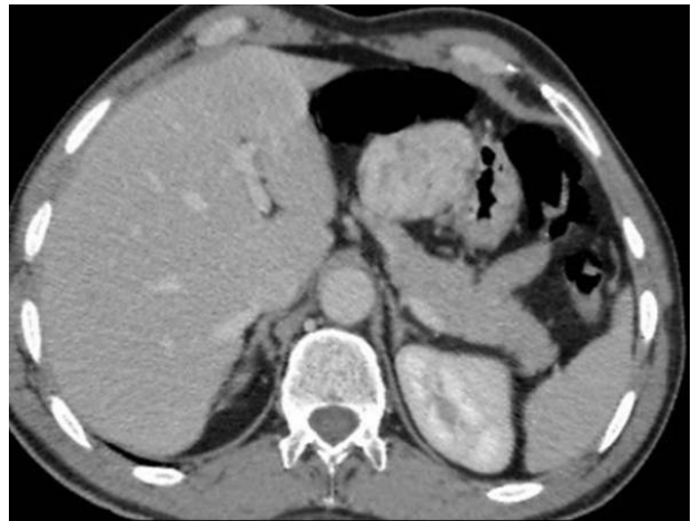
Fig. 2. 45-year-old female patient, mass which extends exophytically in stomach antrum and that is hyperdense compared to liver parenchyma.