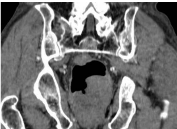
Fig. 3. 72-year-old male patient, endoluminal mass with rectal location.