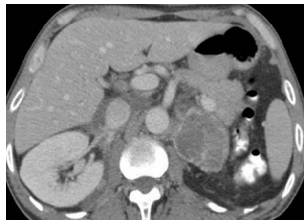
Fig. 4. 35-year-old male patient, necrotic mass in left retroperitoneal fatty tissue.