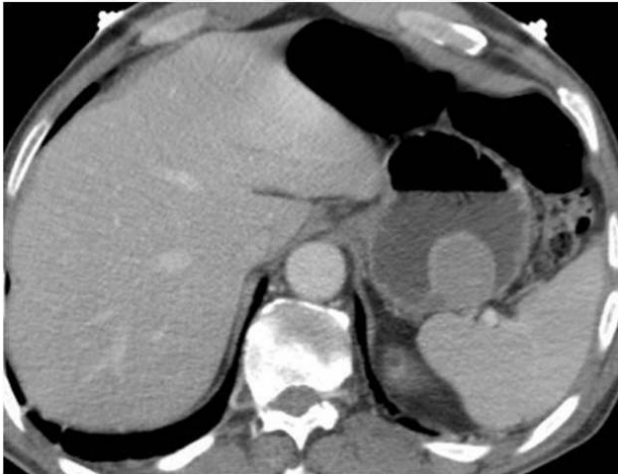
Fig. 5. 66-year-old male patient, hypodense mass with smooth contour in stomach corpus.