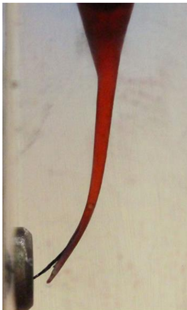
Fig. 2. The black ink represents the initial canal shape. The area with red ink shows the ledge formation occurred in OC group

Simulated canals: Forty endo-training resin blocks with J-shaped canals that have 0.02 taper, 10 mm radius of curvature, 70° angle of curvature, and 16 mm working length were used in this study. The canal openings of the simulated canals were controlled with the # 10 K file. The samples were stained with black ink (Winsor & Newton, Colart Tianjin Art Materials, Tianjin, China). The images of the samples before the instrumentation were taken with a photo camera (Canon EOS 700 D, Canon Incorporated, Tokyo, Japan) which was adapted to a standard setup that has a metal holder for the stabilization of the blocks. Then all