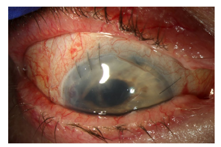
Fig. 1. Right eye post-procedure.

In January 2021, the patient received an immediate sequential bilateral endothelial keratoplasty with a DSAEK in the right eye and a DMEK in the left eye. The surgery went smoothly with no immediate complications. The post-operative appearance of her right eye is demonstrated in Figures 1 and 2, while the post-operative appearance of