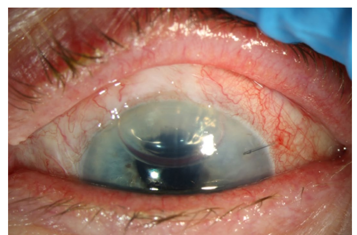
Fig. 3. Left eye post-procedure.

The immediately sequential approach is not usually employed in endothelial keratoplasty. There are no clear guidelines for immediately sequential bilateral endothelial keratoplasty. This approach is more commonly used in cataract surgery and delivers comparable post-operative outcomes to delayed sequential bilateral cataract surgery.<sup>[2]</sup>