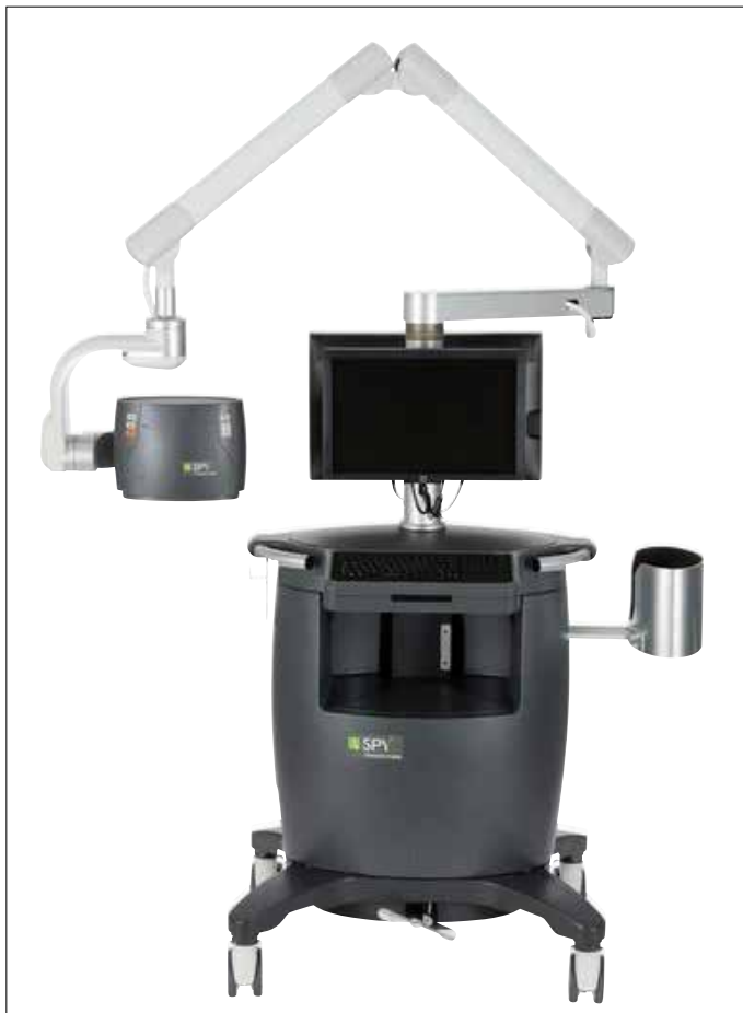
Figure 4. SPY fluorescence imaging system

The reflection of coherent laser light in Doppler is used to measure the blood flow velocity in LDF. The laser light is emitted from a source, and the back-scattered light, through which the frequency shift is determined, is collected. This frequency shift is proportional to the number and speed of the red blood cells in the measured area. The measurements are expressed as relative velocities, usually in the form of mL/min/100 g, which are the abbreviated LDF units (16,17). It is a noninvasive and continuous imaging device that evaluates perfusion and shows the flow within the tissue capillaries rather than pedicles. Periflux System 5000