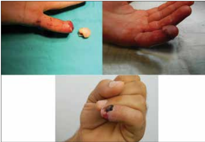
Figure 1. Restoration of blood flow after fingertip amputation and replantation in a trauma patient

accompanied by devastating consequences may occur. Since an early diagnosis of the vascular problem and the surgical intervention are closely related to the tissue recovery, postoperative monitoring of the perfusion of the transplanted tissue is extremely important.