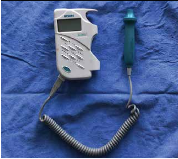
Figure 3. Hand Doppler

Flap monitoring techniques can be classified according to the monitoring mechanism (vascular flow measurement according to tissue ischemia); time of use (intraoperative and postoperative); and invasiveness (invasive and noninvasive). The techniques monitoring the vascular flow include hand Doppler, implantable Doppler, color duplex ultrasonography, fluorescence angiography, and laser Doppler flowmeter (LDF). The techniques monitoring the tissue metabolism and ischemia are near-infrared spectroscopy and microdialysis. There are additional developing techniques such as thermal imaging, pH monitoring, transit-time volume flow measurement, and spatial frequency domain imaging (SFDI).