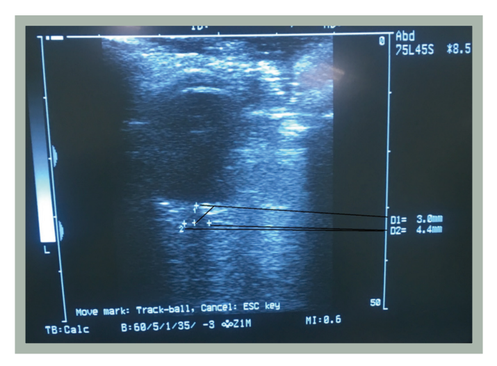
Figure 2. D1: Distance behind the eyeball, D2: ONSD ONSD: Optic nerve sheath diameter

An experienced anesthesiologist, unaware of the patient's group, used a 7.5-MHz linear probe to evaluate ONSD using ultrasonography. After applying ultrasonic gel, the linear probe was positioned and affixed onto the patient's closed eyelids using transparent Tegaderm. The optic disk vitreous body, and hypoechoic ONS were examined by carefully adjusting the angle of the probe (Figure 2). The ONSD was