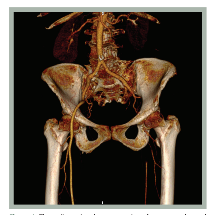
Figure 1. Three dimensional reconstruction of contrast enhanced computed tomography scan demonstrating left external iliac artery thrombosis

A 62-year-old woman presented with dyspnea and a cold. painful left lower limb. Her medical past was insignificant except for a right total knee replacement that occurred 2 months ago. The patient had recovered from surgery and was already mobile. She had received the first dose of BNT162b2 mRNA vaccine 35 days before presentation. On physical examination, she was slightly tachypneic with normal blood pressure and heart rate. The electrocardiogram showed a sinus rhythm. Heart and lung sounds were normal. Her left lower extremity was cyanotic and cold with absent popliteal and pedal pulses, minimal sensory loss, and normal motor function. Doppler signals distal to the left femoral pulse were inaudible. Laboratory tests revealed normoxia, hypocapnia, a D-dimer level of 5.61 \mu g/mL (normal range <0.5 \mu g/mL), and a platelet count of 171,000 per µL. Computed tomography angiography of the lower extremities and pulmonary arterial system demonstrated thrombotic occlusion of the left external iliac artery (Figure 1) and bilateral PE (Figure 2). There were not any signs of right ventricular overload or dysfunction, intracardiac thrombi, or any septal defects on the transthoracic echocardiographic examination. Venous duplex ultrasound of the extremities was negative